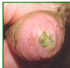
Teat Exfoliation in Progress