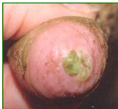
Teat Exfoliation in Progress

Valiant Pre-Post... PROMOTES HEALTHIER TEATS!