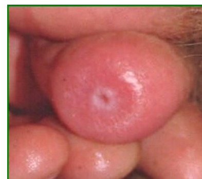
Exfoliation End Result Healthy Teat Condition From Valiant Pre-Post