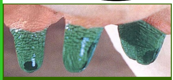
Express Prime Conc. had > 5 \log reduction on the following 8 organisms