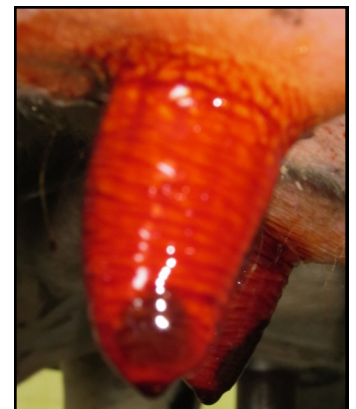
Barrier 112: "A True Barrier" that Kills and Keeps Killing!

7 EXPRESS Chlorine Dioxide & LAS 1.65% EMOLLIENT SOFT