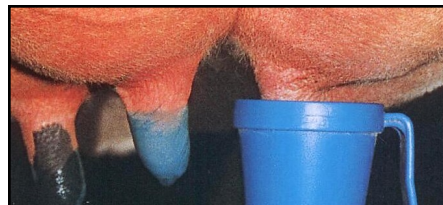
Valiant PRE: Blue

5 Valiant SHIELD Chlorine Dioxide & Heptanoic Acid 5% EMOLLIENT SOFT