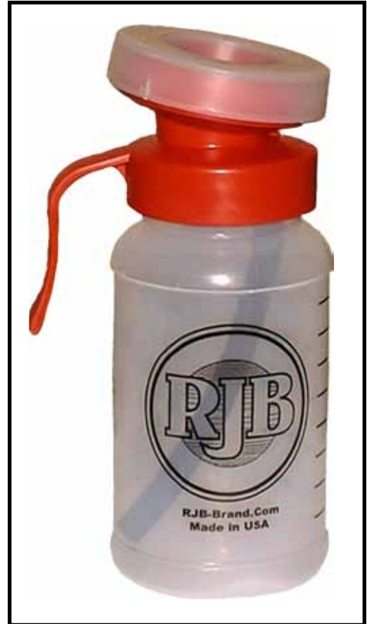
Available in five colors

The RJB Top Dipper is made from the latest technology in engineered plastics to give you a durable and quality teat dip cup that will last many seasons.