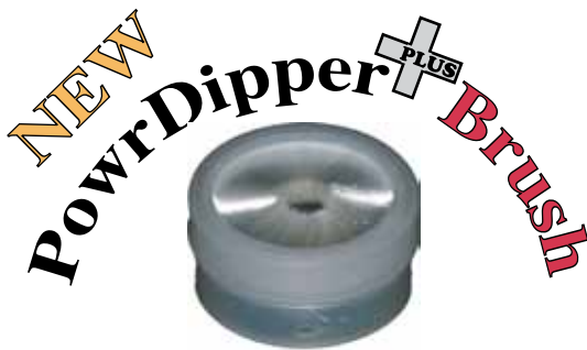
Brush Splash Guard 10-60852