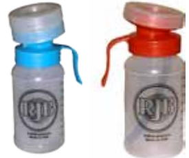
With PowrDipper Plus Without PowrDipper Plus

more than doubling the capacity of the cup. It is easily added to any RJB dip cup or PowrDipper when needed and can be removed to return to normal use. The PowrDipper Plus allows herdsmen to dip larger teats without taking extra care to get good coverage. Teat dip coverage of the teats is the same whether using the PowrDipper Plus or the standard cup.