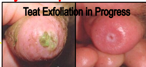
Teat Exfoliation in Progress

Primary Germicide: Chlorine Dioxide - Secondary Germicide: LAS 12-Hour Residual Kill!